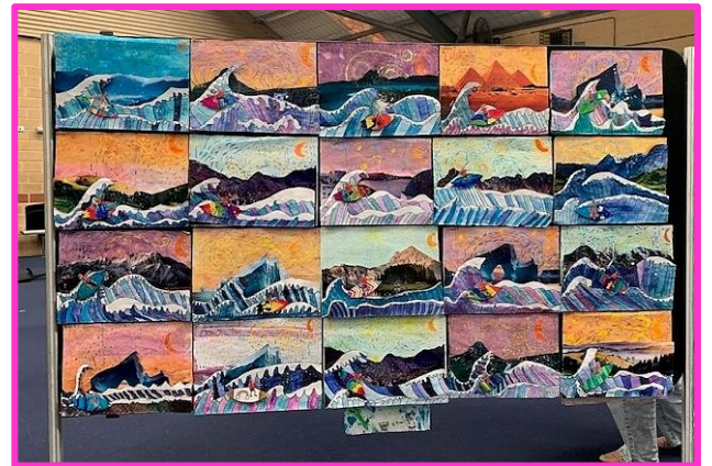
Our Art Teachers