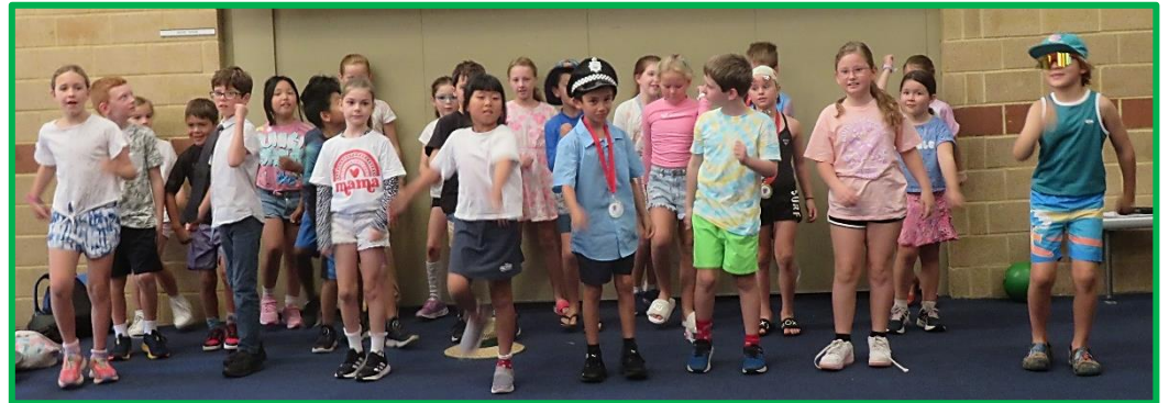
Assembly Room 5